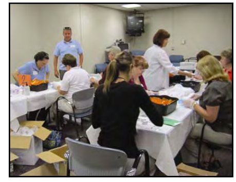
Department of Health employees prepare for emergencies with a pill packaging drill.

92 percent of Department of Health staff received public health emergency preparedness training and ensured federal funding compliance in National Incident Management Systems