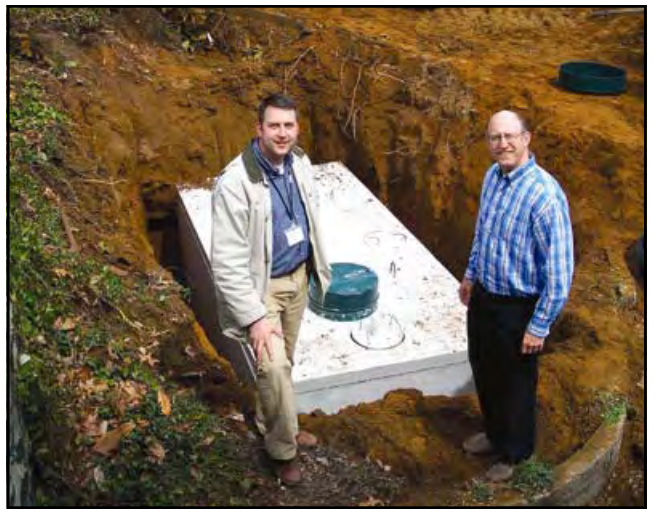
Environmental Health sanitarians assist homeowners with the application process for Bay Restoration Fund -approved nitrogen reducing units.