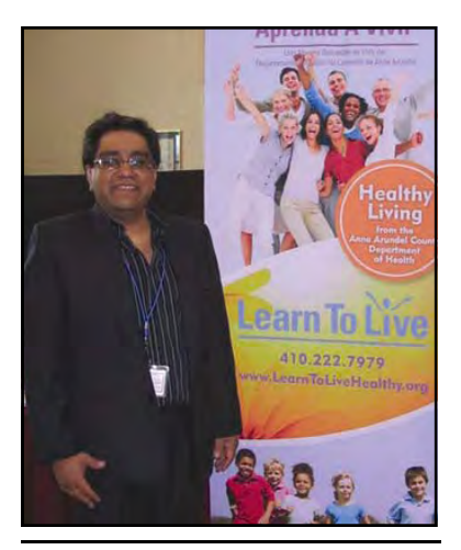
The Community Education and Health Disparities Program offers County residents information on healthy lifestyles.

• 1,745 investigations were conducted on reportable diseases