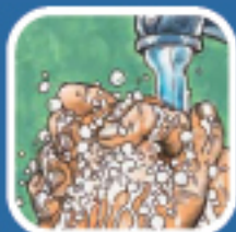
Apply soap & rub for 20 seconds