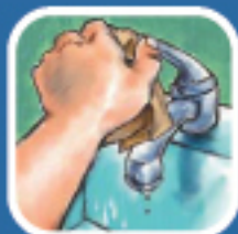
Use towel to turn off faucet