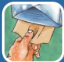
Dry with paper towel